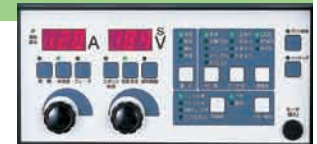
Simple control panel